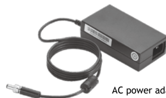
AC power adapter (for GOT-5840T-830-J)

Touch Panel Computers for Various Industry Applications