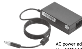
AC power adapter (for GOT-5120T-830-J)

Touch Panel Computers for Various Industry Applications